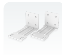
• Rack ears