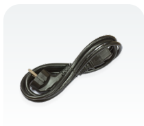
• 2 Power cords