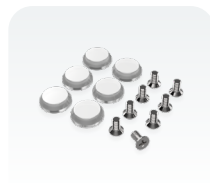
• Fastening set